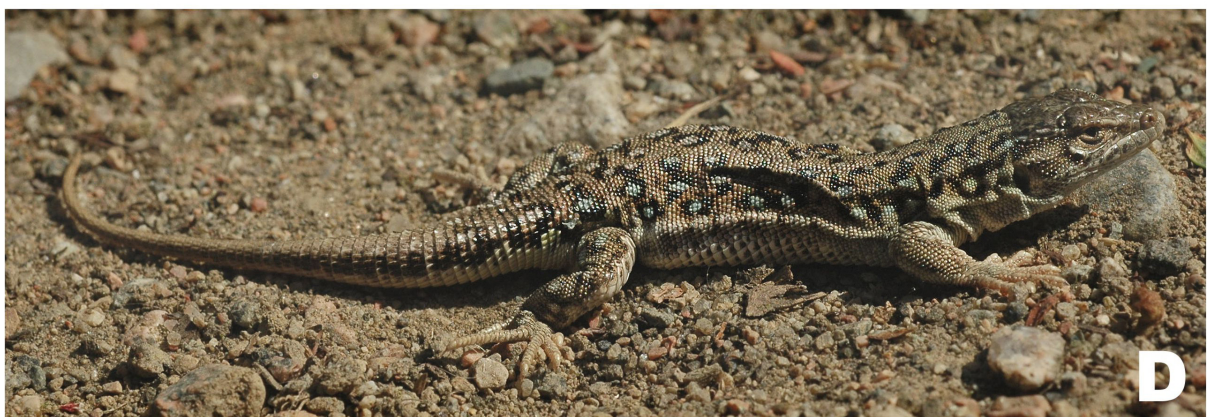
FIGURE 3. Major coloration patterns in Eremias arguta . A—banded form Eremias arguta “ potanini ” from Tokty river, Alakol valley, East Kazakhstan (photo by O. Belyalov); B—spotted form Eremias arguta arguta from Dzhezkazgan, central Kazakhstan (photo by A. Kornelyuk); C—ocellated form Eremias arguta ssp. from Konyrolen, Ili valley, East Kazakhstan (photo by O. Belyalov); D—ocellated form Eremias arguta ssp. from Kaindytau, Ili valley, East Kazakhstan, showing bluish ocelli (photo by O. Belyalov).