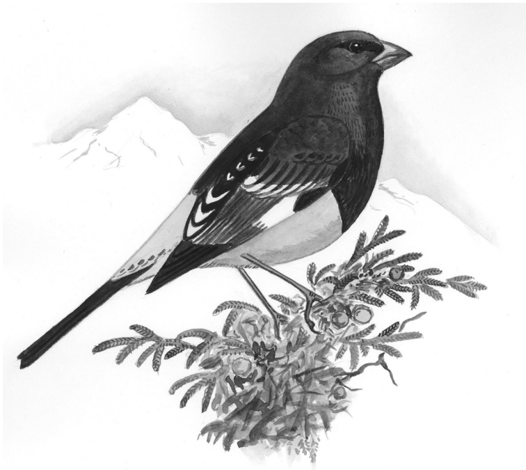
White-winged Grosbeak Mycerobas carnipes (Hodgson, 1836)