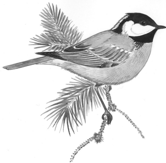
Coal Tit Parus ater Linnaeus, 1758