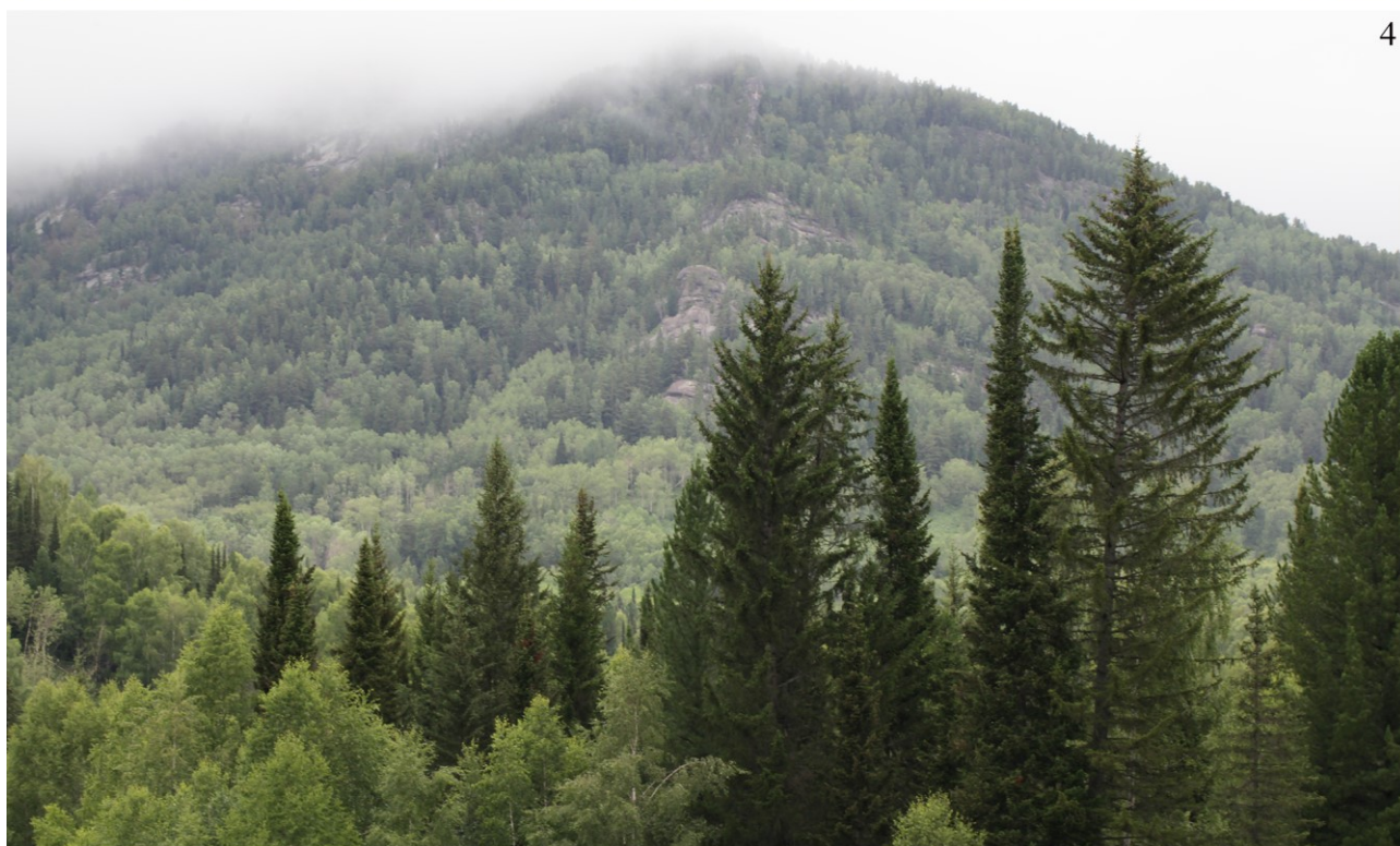
Figures 3–4. The habitat of Trichosea ludifica : Kazakhstan, East Kazakhstan region, Southwestern Altai: Lineysky Ridge, West Altai, Nature Reserve, "Chernaya Uba" cordon.